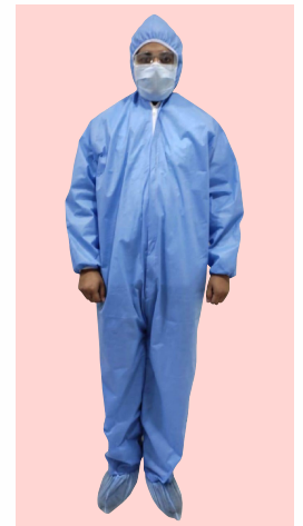
Coverall (30GSM/ 70GSM/ 90GSM) ▶