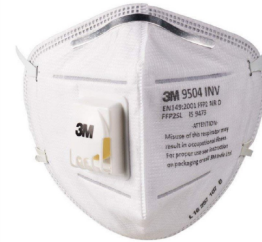
N-95 + FFP2 Mask: