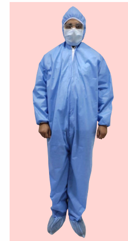
◀ Gown (30GSM/ 70GSM/ 90GSM)